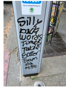
April 2022 through April 2023

The below statistics show an overview of the cleaning program from April 2022 to April 2023. We saw a 35% increase in spill Clean up, and a 52% increase in Human hazardous waste clean up.